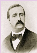
Alexander Borodin String Quartet No2 in D Major